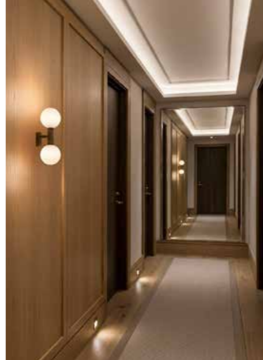
FUTAKO WALL G9 2645-BB(B)-071-II(I)-12